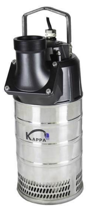
Attention: pictures for illustrative purposes

Installation: Vertical Floating on board machine: not present